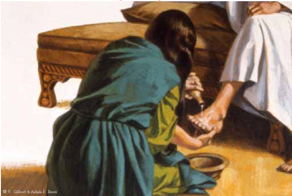
Sinful woman pours perfume